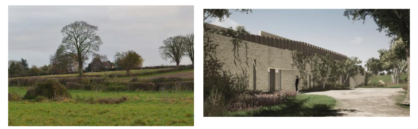
Figure 6 - Site Photo taken from the North of the Northern Boundary with Existing Dwelling (L) & Visual of the Proposed Northern Elevation (R)

Further, whilst I note there would be windows at first floor, these large glazed panels would serve a corridor leading onto the master suite rooms (on the south elevation) (including dressing rooms, bathroom, bedroom etc.) and the stair well (on the northern elevation) which are unlikely to be areas that would be continuously lit given they are essentially circulation spaces. As such it is not considered that neighbouring properties to the south would be adversely effected as a result of this proposal (including through light pollution). The same conclusion can be drawn for properties to the NE of the site which would be in excess of 100m from the dwelling and similarly buffered by intervening landscaping. Comments from local residents also refer to the impact on their amenity through the loss of a view, however this is not a material planning consideration. Overall, given the conclusions drawn above it is considered that the proposal would be in accordance with Policy DM5 and the guidance in the NPPF in this regard.