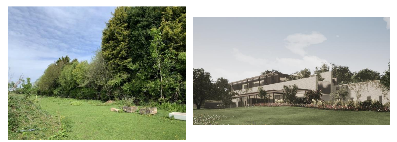
Figure 1 - Site Photo of Southern Boundary from Outside the Site (L) & Visual of Proposed Southern Elevation (R)