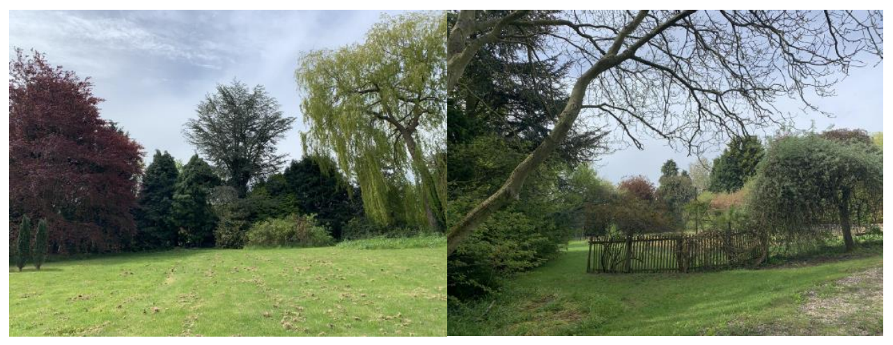
Figure 3 - Site Photos of Eastern and Southern Boundaries

The southern side elevation of the dwelling would sit c. 40m from the southern boundary and the eastern elevation would be c.50m from the eastern boundary, both of which are formed by mature trees, most of which would be retained as part of the proposal. The property Brigholme to the SW corner of the site would be in excess of 90m from the proposed dwelling, between which would remain extensive mature tree cover and landscaping – further, owing to the orientation of the proposed dwelling any visibility of the dwelling would be of the eastern elevation which has glazing panels recessed within the staggered façade as shown in the visual below. It is not anticipated that any adverse amenity impact (including through light pollution) would occur on this occupier or properties directly to the east.