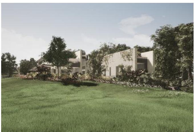
Figure 4 - Visual of Proposed Eastern Elevation

The southern side elevation of the dwelling would sit c. 40m from the southern boundary and the eastern elevation would be c.50m from the eastern boundary, both of which are formed by mature trees, most of which would be retained as part of the proposal. The property Brigholme to the SW corner of the site would be in excess of 90m from the proposed dwelling, between which would remain extensive mature tree cover and landscaping – further, owing to the orientation of the proposed dwelling any visibility of the dwelling would be of the eastern elevation which has glazing panels recessed within the staggered façade as shown in the visual below. It is not anticipated that any adverse amenity impact (including through light pollution) would occur on this occupier or properties directly to the east.