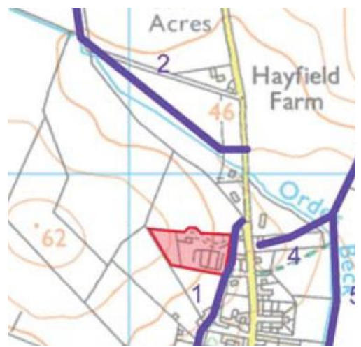
Figure 2 - PRoW/Footpath Map (p.37 of the LVIA)

The LVIA concludes that overall the effects of the scheme are considered to be long-term in duration given the building will become a permanent feature of the landscape, however there would be limited vantage points where the dwelling would be visible. The LVIA states that visibility from receptors would be 'negligible' and in any event would be against the backdrop of the vegetation that surrounds the site. Further, I am mindful that visibility does not equal harm and that the LVIA does not conclude that there would be any adverse visual effects as a result of the development.